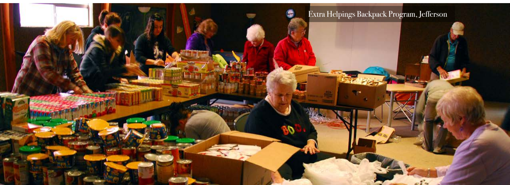
Extra Helpings Backpack Program, Jefferson

Albany was identified as needing a “backpack program.” Local community organizations interested in supporting efforts to increase access to food for youth should be connected with organizations running backpack programs. Free meal site volunteers recognized difficulty in reaching out to youth. Suggestions for better outreach would be useful. Finally, a study of the effect of a 4-day school week on parents of students at the Central Linn School District would explain the severity of the problem.