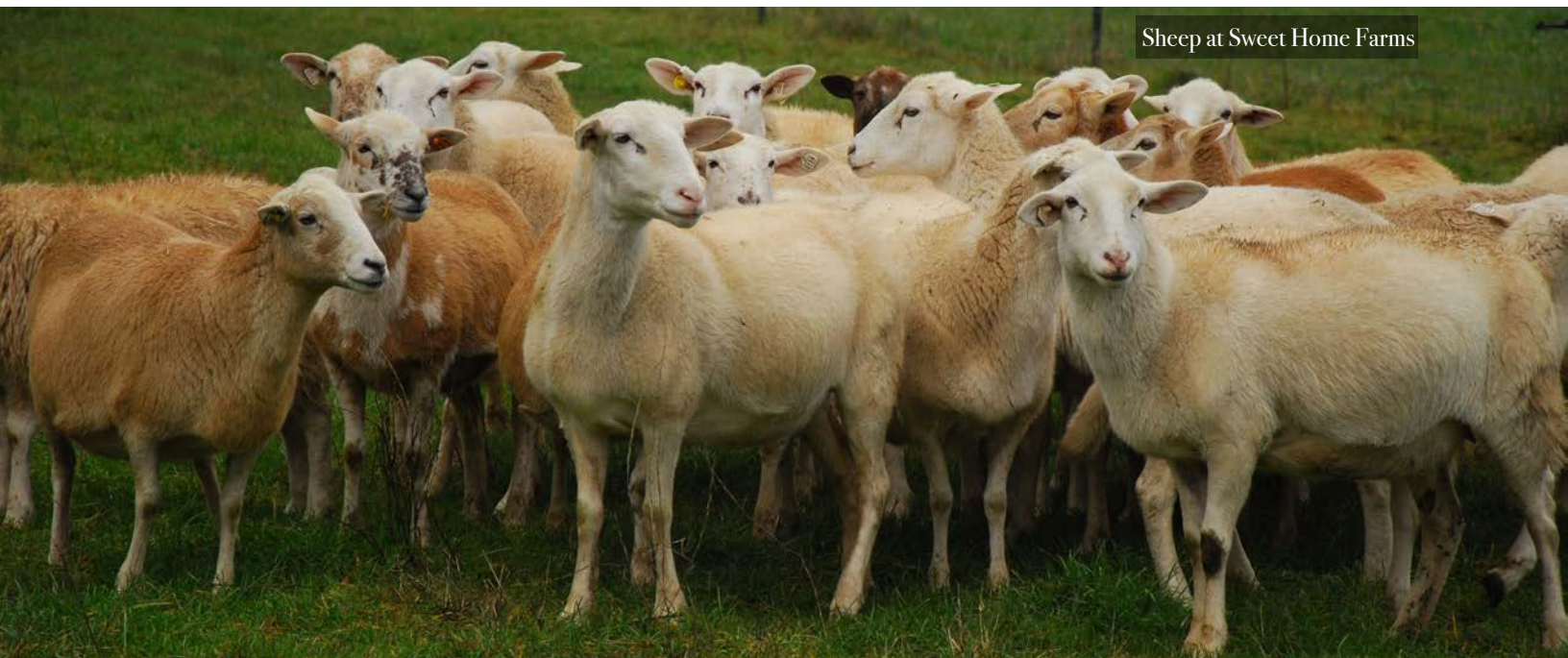
Sheep at Sweet Home Farms