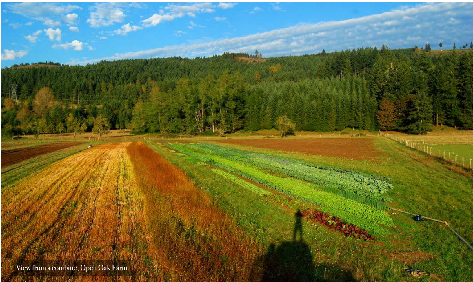
View from a combine, Open Oak Farm.

Agriculture in Linn County is defined by heavy clay soils, access to water rights, availability of scale-appropriate processing and storage and is driven by consumer demand. On the commercial scale, grass seed, wheat for the international market, sheep, cattle and a few vegetable crops (green beans, sweet corn and pumpkins) dominate, yet over 200 commodity crops are grown. While the commercial goods represent a great deal of food, the majority is shipped away from our area. Focused on the local market are numerous smaller scale farm operations ranging in size of a few acres to a couple hundred acres. Acquiring land, access to water, and poor soil quality are the major issues effecting farmers of all size, and particularly beginning or young farmers.