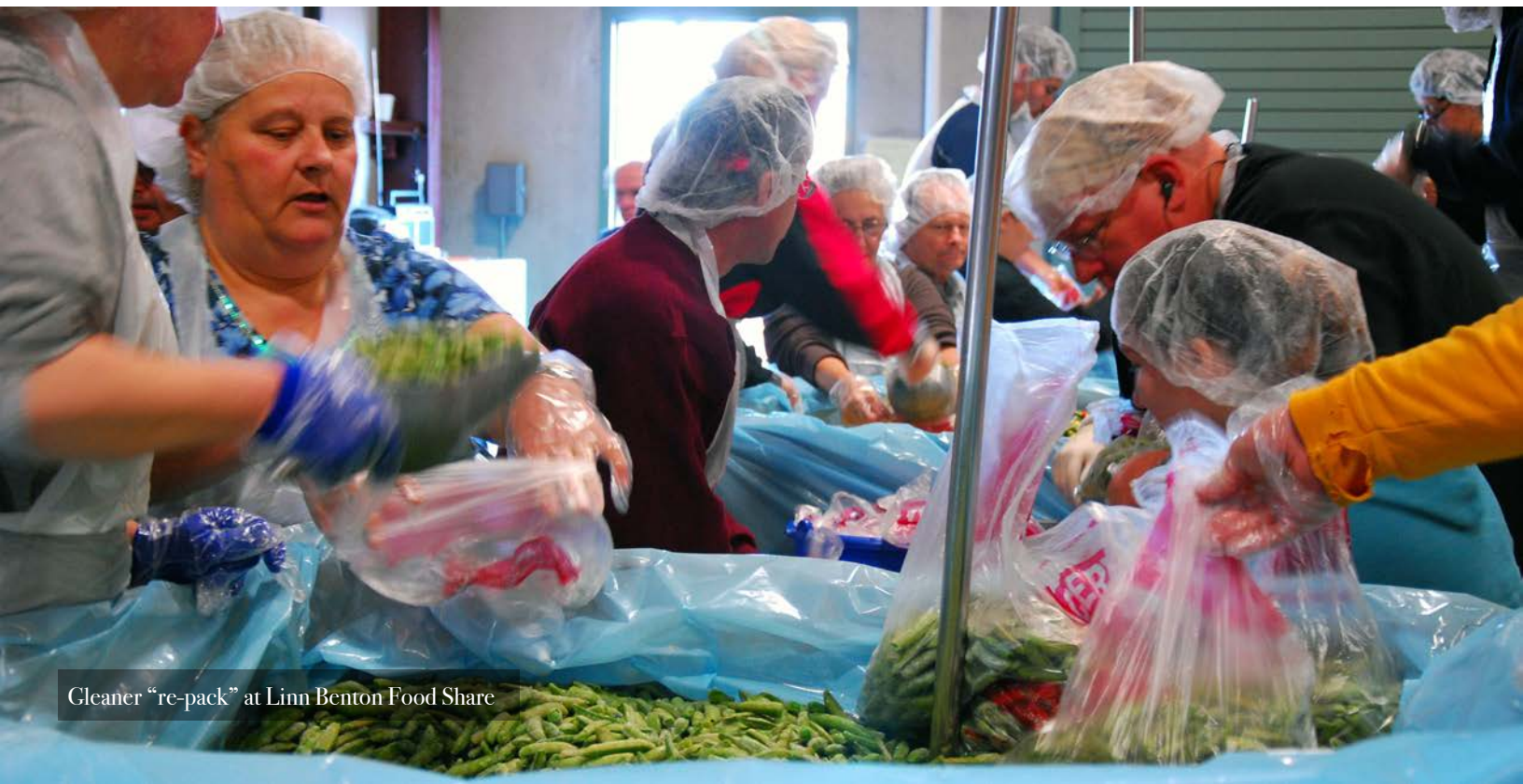
Cleaner "re-pack" at Linn Benton Food Share

Gleaning is the tradition of farmers allowing others to gather excess food left after a harvest. The tradition dates back to Biblical times. Under the Holiness and Deuteronomic Codes, farmers were required to leave sections of their field un-har-