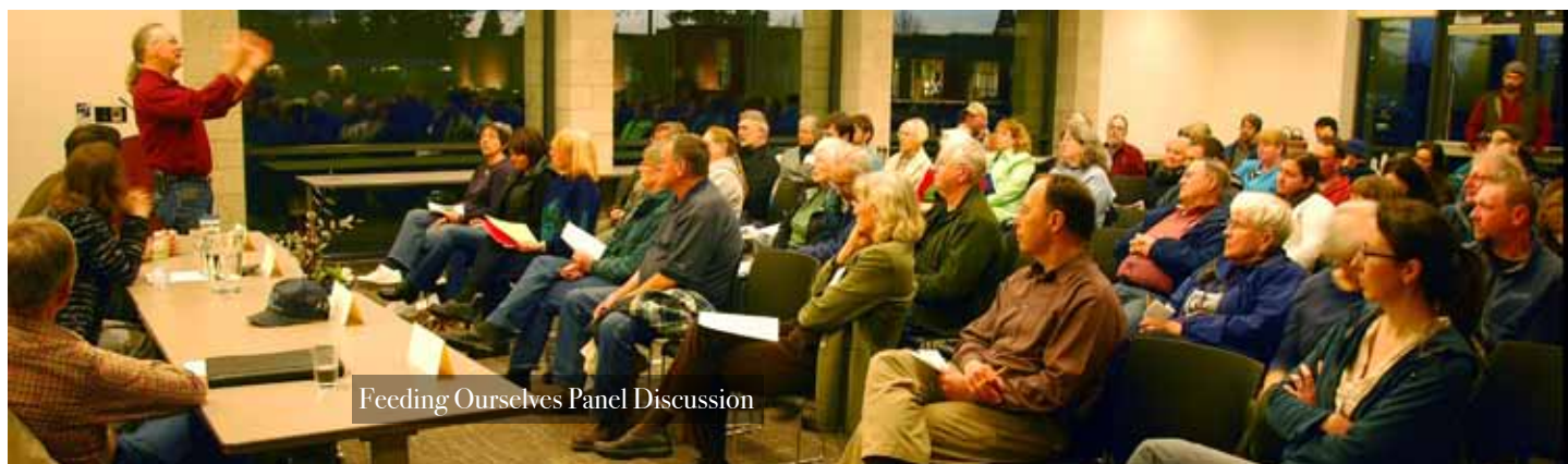
Feeding Ourselves Panel Discussion