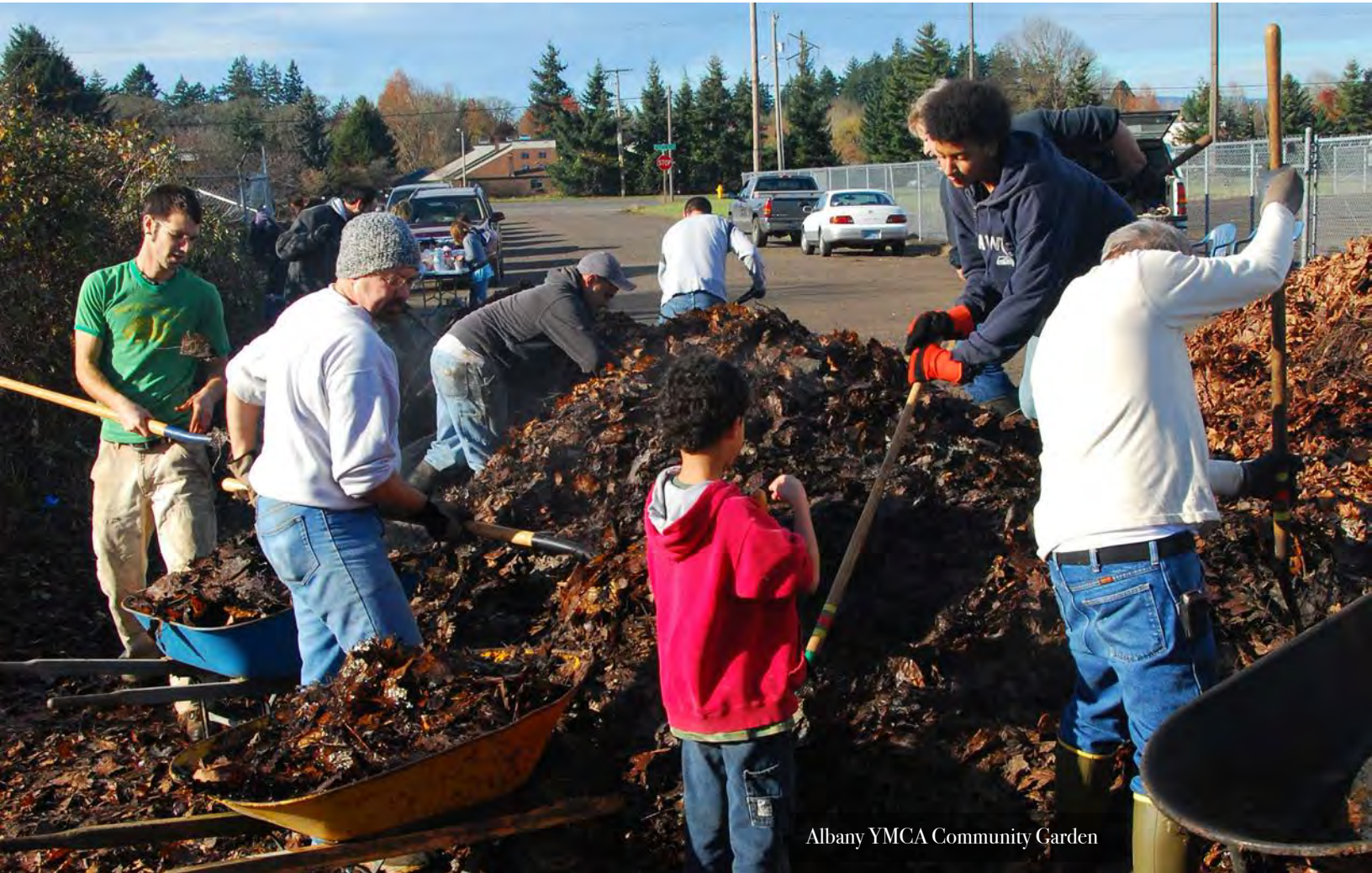
Albany YMCA Community Garden

In the last five years, a multitude of community food systems efforts throughout Linn County have begun - from farmers' markets to community gardens to farm to school programs to community food systems organizations - to keep up with the rising demand for local food, supporting local farmers, interest in building community, and encouraging healthier lifestyles. Partnerships between universities, public health organizations, school districts, non-profits, farmers and more continue to organize around food issues. Regional leaders, such as Ten Rivers Food Web, have set the pace with food literacy campaigns in both Benton and Linn County. Local organizations like Calapooia Food Alliance create the programmatic pieces necessary to get local food to their community. And more efforts are started every day.