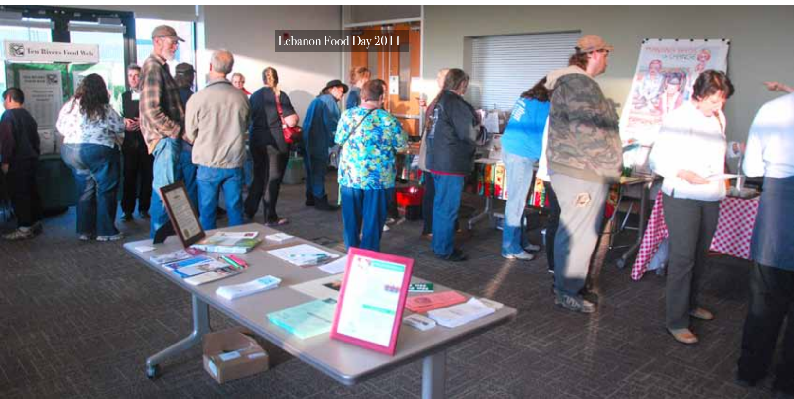
Lebanon Food Day 2011

After presentations, panelists answered questions concerning how to avoid mass-marketed, unhealthy foods; the financial viability of local food farmers; the practical acreage for growing local beans and grains; how grass seed farmers can include food crops in their business; equipment-sharing farm cooperatives; and how many genetically modified (GM) crops are grown in this area. Comments from attendees were overwhelmingly positive. They requested more programs on subjects such as GM crops, school gardens, gardening workshops, transition to organic, and cooking. The TRFW-EL Chapter intends to host another panel discussion, based on these suggestions, in 2013.