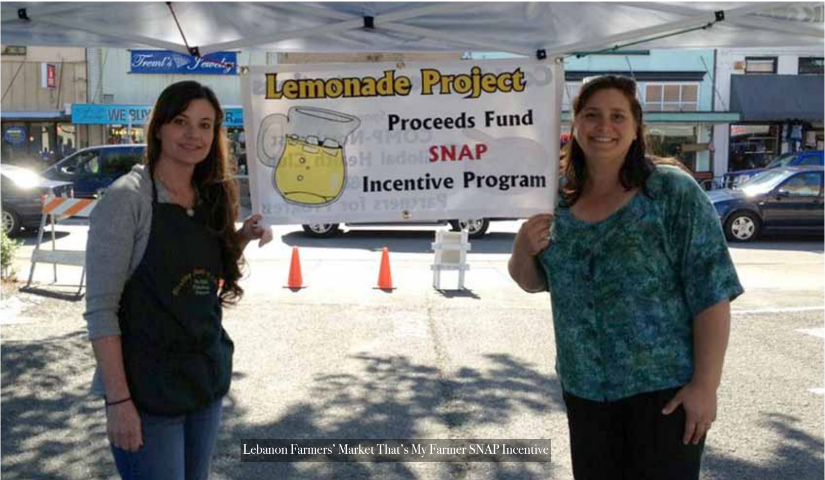
Lebanon Farmers' Market That's My Farmer SNAP Incentive

Despite a bounty of food and community programs focused on it, many people in Linn County still have a hard time accessing enough food. The Linn County CFA includes statistics indicating a high need for federal nutrition services and illustrates how young people and seniors face special hurdles. Profiles of successful programs show how a community can pull together to help those in need with respect.